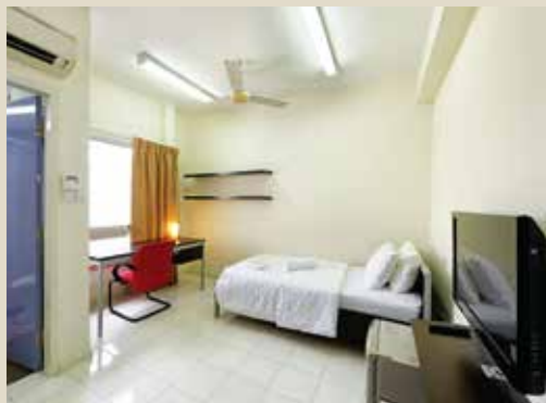
Single Ensuite Room