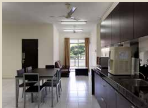
Single Unit Common area